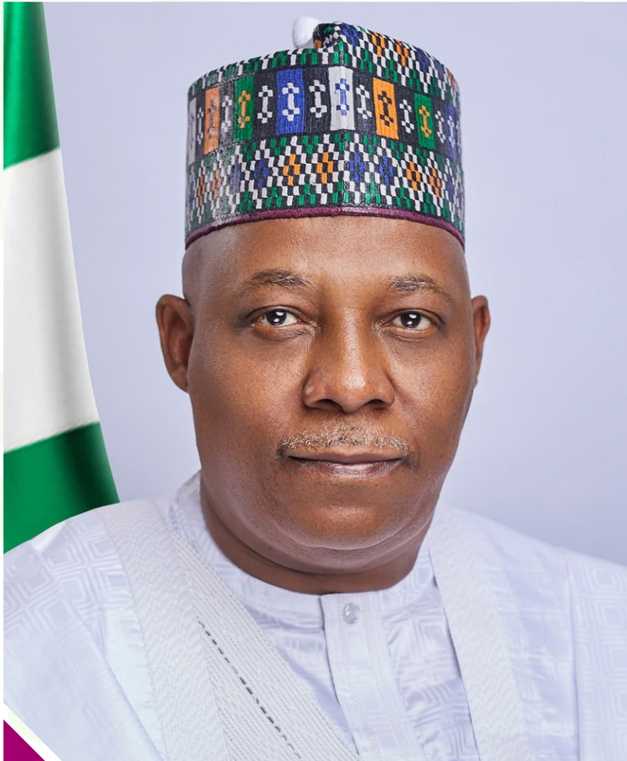
HIS EXCELLENCY Senator Kashim Shettima, GCON Vice-President, Federal Republic of Nigeria