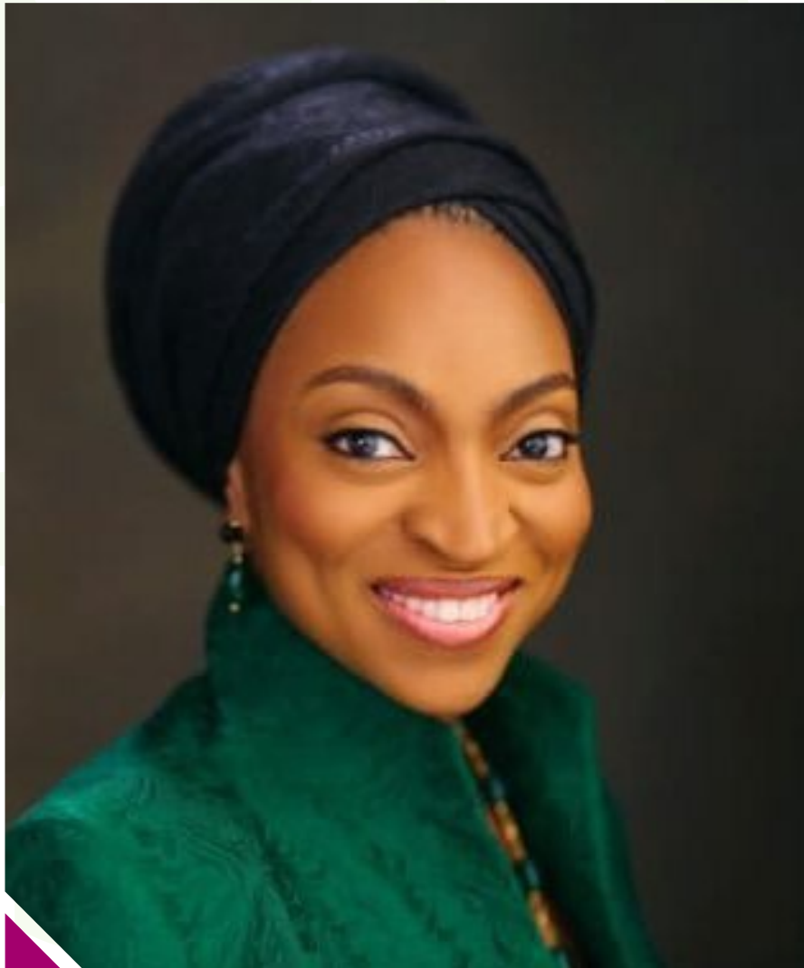
Dr. Jumoke Oduwole, MFR

Honourable Minister of Trade and Investment