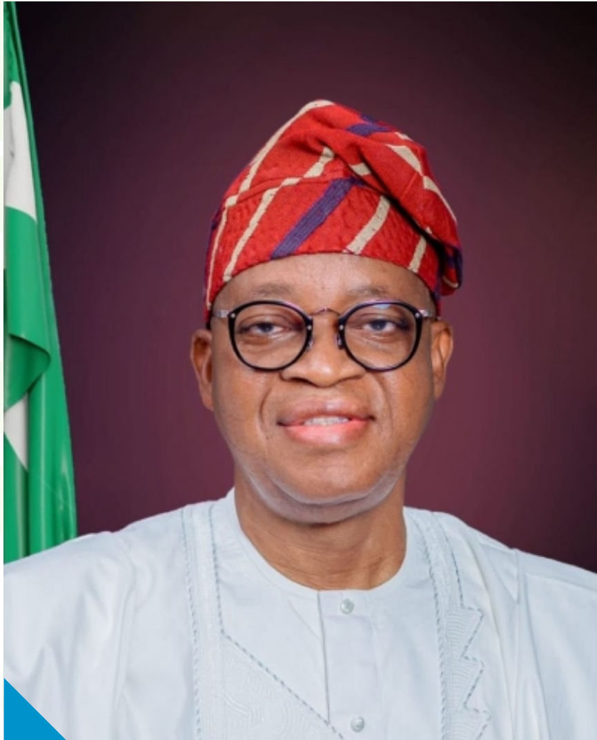
Dr. Adegboyega Oyetola, CON Honourable Minister of Marine and Blue Economy