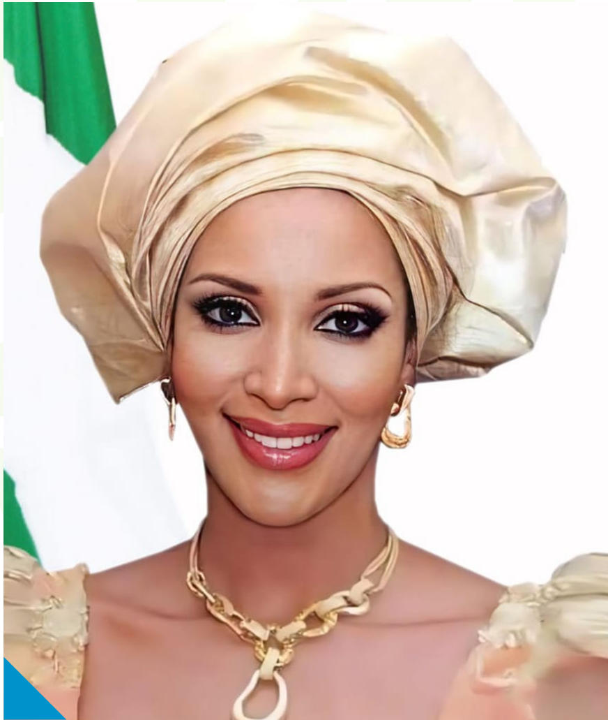
AMB. Bianca Odumegwu-Ojukwu Honourable Minister for Foreign Affairs