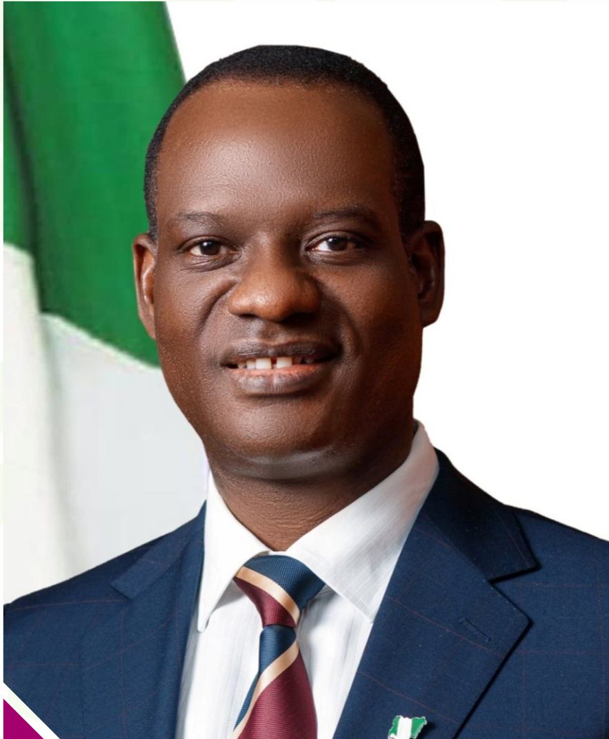
Prof. Taiwo Oyedele Honourable Minister of Finance and Coordinating Minister of the Economy